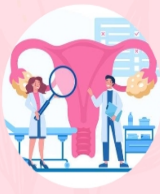
Normal changes in the cervix