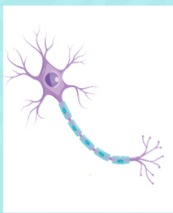
Problems with nerves