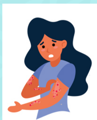
Infection or rashes