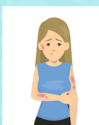
Bruise, wound, or burn on the skin