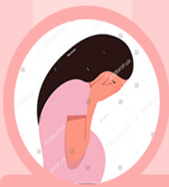
Problem tolerating heat