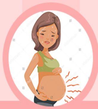
Indigestion and stomach cramps