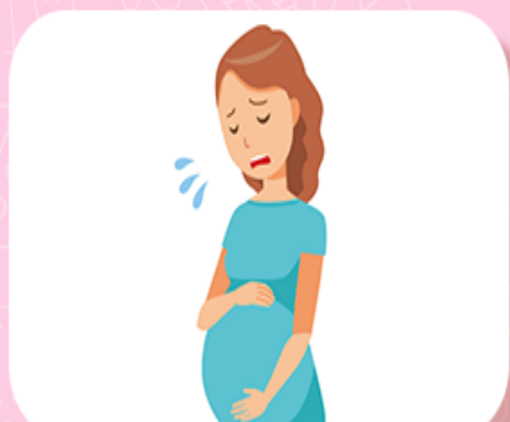
Sign of labor