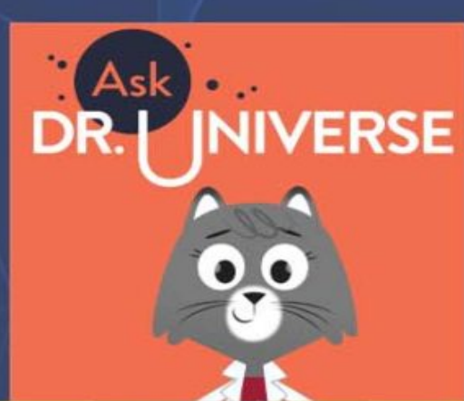
Ask Dr. Universe

Game based on algebra and mathematical learning