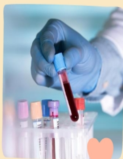
Blood test for protein levels