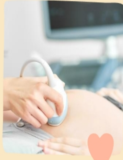
Combined screening test