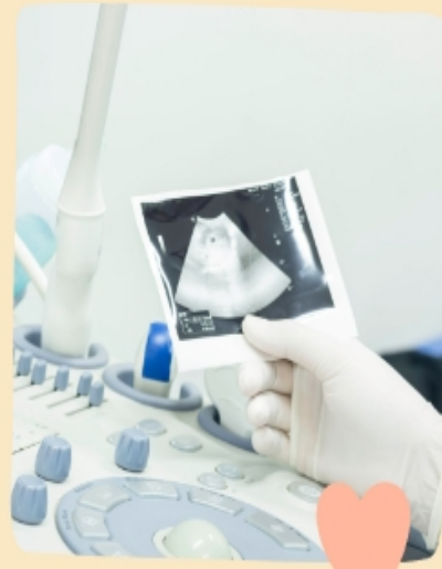
Measurement of gestational age and nasal bone length