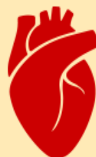
Congenital heart defect