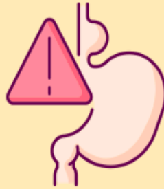
Congenital diaphragmatic hernia (CDH)