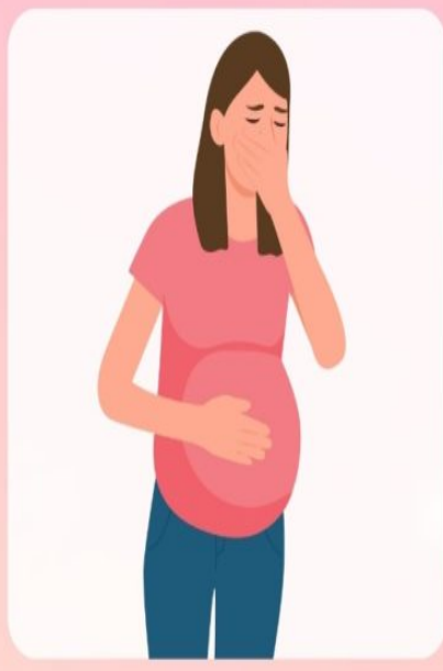
Vomiting or nausea