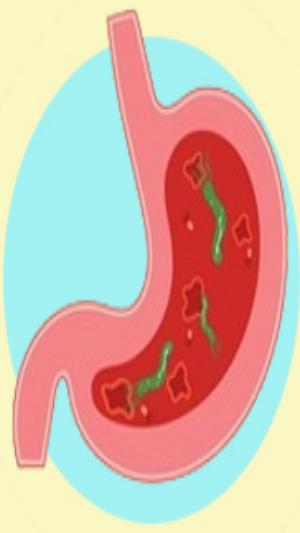
Ulcers in the gastrointestinal system