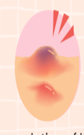
Accumulation of blood outside the blood vessels