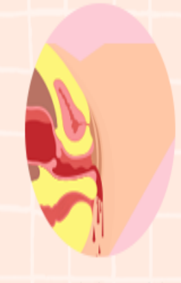
Heavy blood loss after delivery