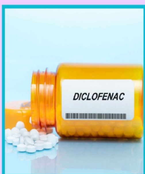
Low dose diclofenac