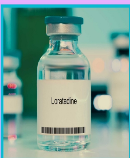
Medications containing loratadine