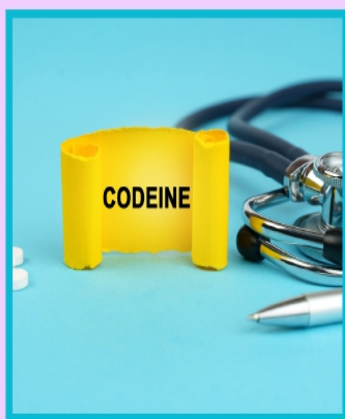
Low dose codeine