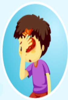
Pain around the eye