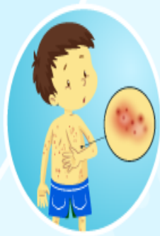
Flat or raised skin rash