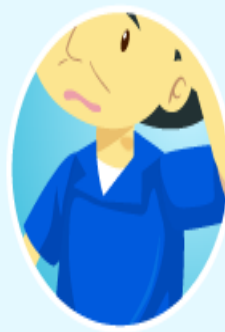
Lymph node enlargement