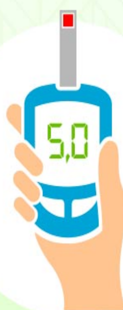
Metabolic disorders such as hypoglycemia and hypocalcemia