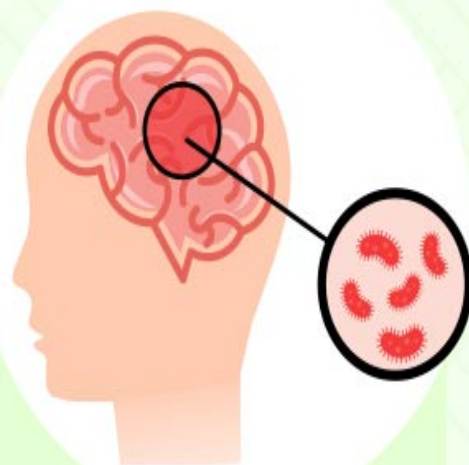
Infections such as encephalitis and meningitis