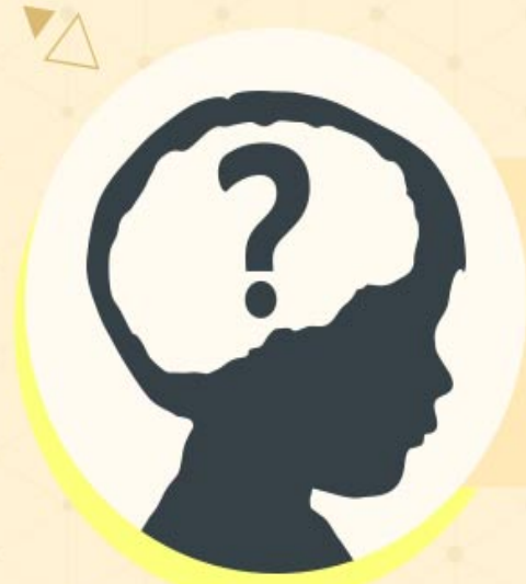
Congenital brain deformities