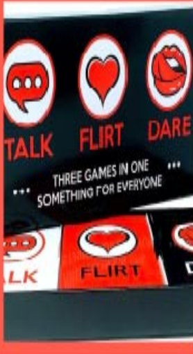
Talk Flirt Dare