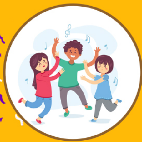
Guessing a song game