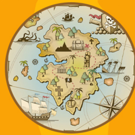
Solving a mystery game