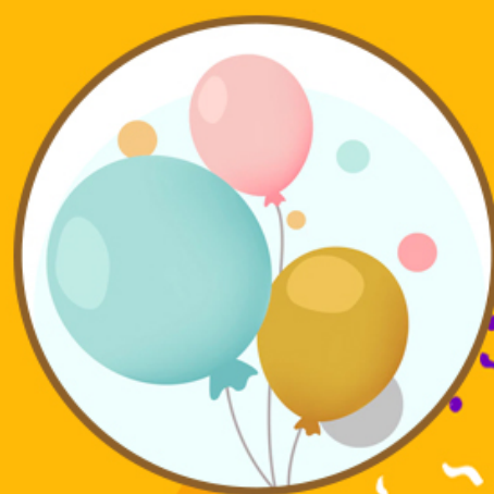
Balloon dare challenge