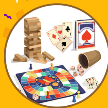
Board or card games such as Bingo