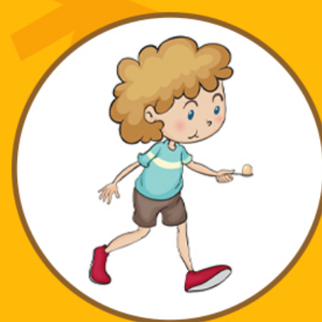
Egg and spoon race