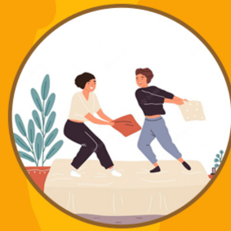
Passing the parcel/pillow