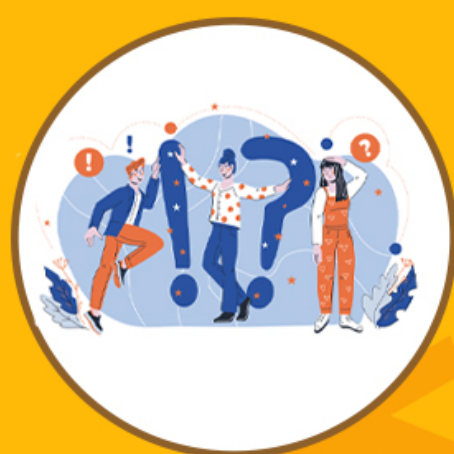
Would you rather questions