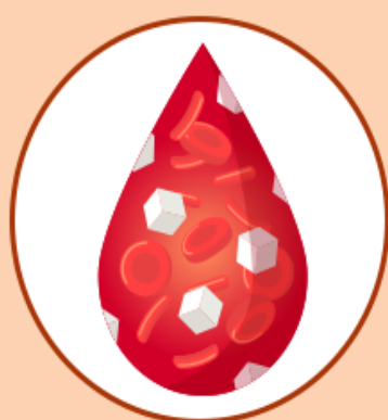
TYPE 1 DIABETES MELLITUS