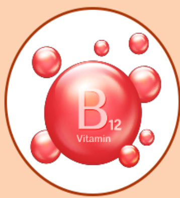
VITAMIN B12 ANEMIA