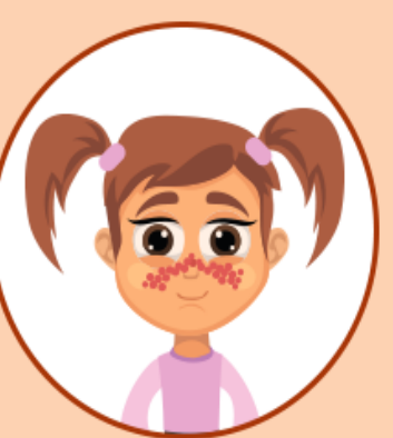
SYSTEMIC LUPUS ERYTHEMATOSUS